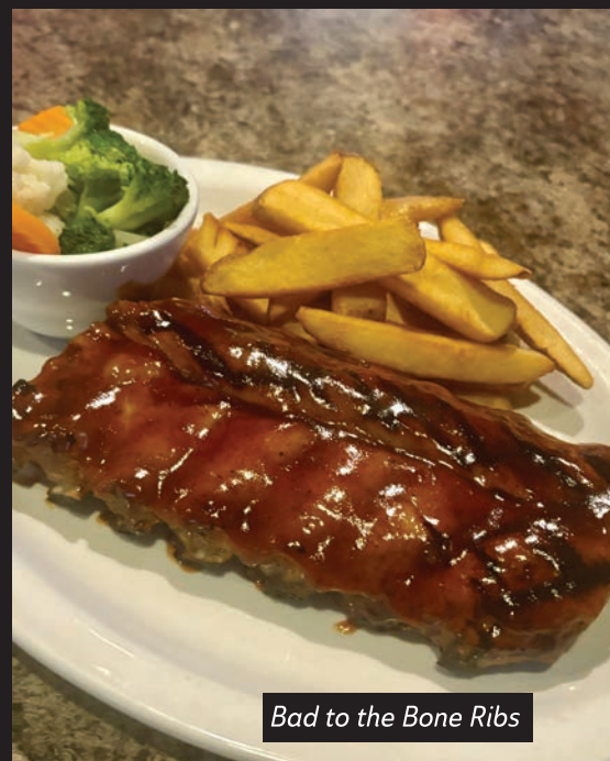
Bad to the Bone Ribs