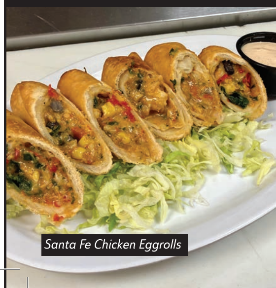
Santa Fe Chicken Eggrolls