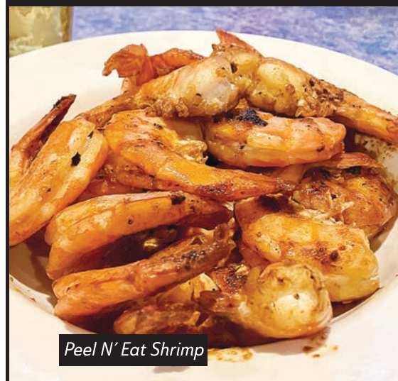
Peel N' Eat Shrimp