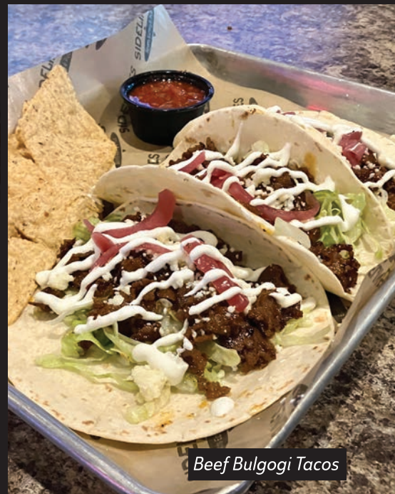
Beef Bulgogi Tacos

Hand breaded perch / chipotle ranch / four cheese blend / lettuce / pickled onion / lime crema 14.99