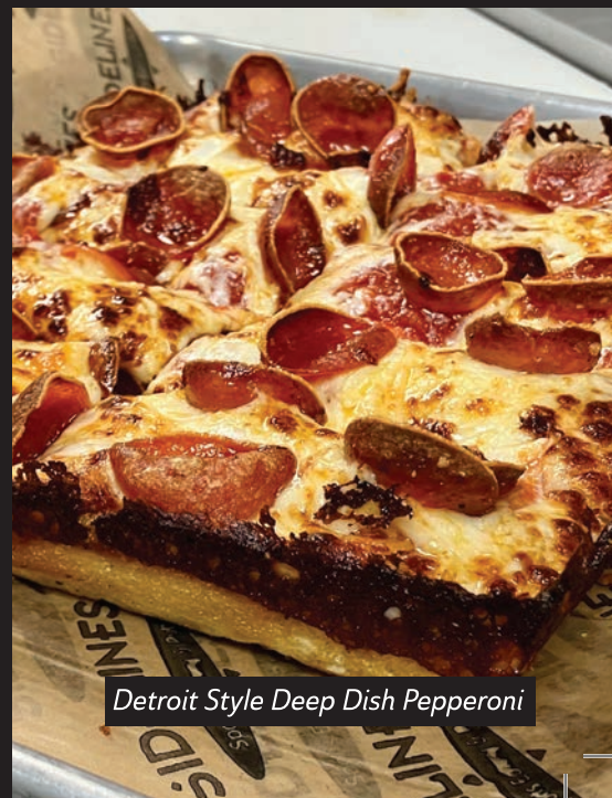
Detroit Style Deep Dish Pepperoni