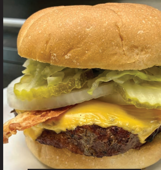
Steak Burger with Bacon & Cheese

BBQ sauce / bacon / cheddar cheese 16.99